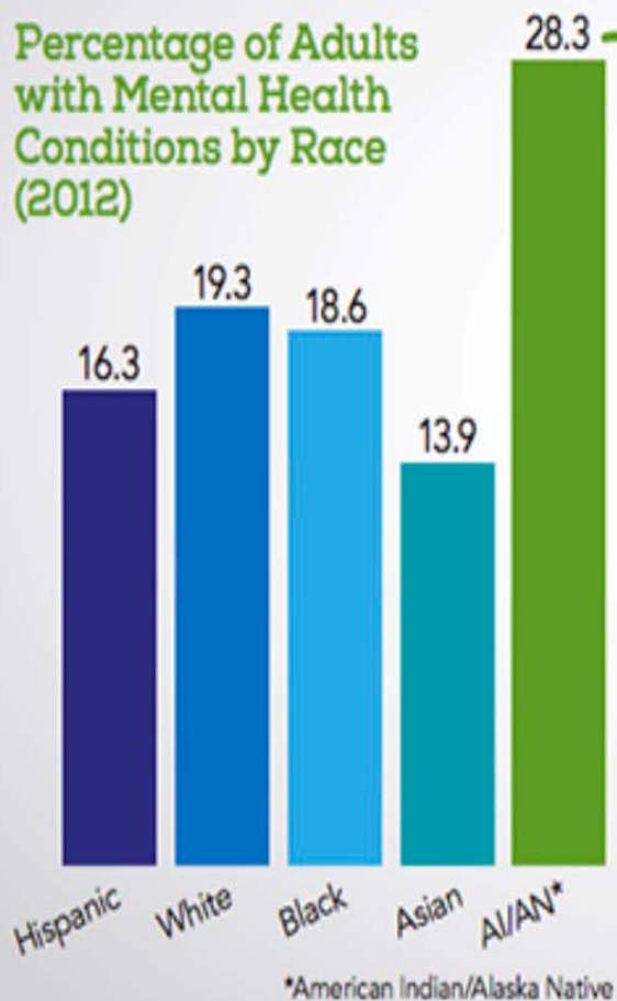
Percentage of Adults with Mental Health Conditions by Race (2012)

NATIONAL SUICIDE PREVENTION LIFELINE 1-800-273-TALK (8255) suicidepreventionlifeline.org